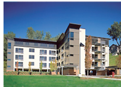
Located on the shores of Lake Champlain in Burlington, the Waterfront Apartments has won numerous awards.

In 2002, a study was conducted to determine the success of this affordable housing model. Based on the 97 houses and condominiums that had been resold, the research evaluated affordability, subsidy retention, wealth creation and residential mobility.