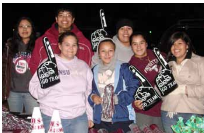
Students in Cherokee Nation's program show off the merchandise they sold at school events to raise money for their SEED accounts.

In-depth discussions with parents who had the opportunity to enroll their children in SEED but did not do so may be instructive. These parents remembered being offered SEED accounts, and understood basic details of the program. Their