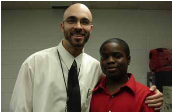
Staff at the SEED programs, like this staff member with Boys and Girls Club of Delaware, were critical to the success of the initiative.

choice approach would also offer a conservative option). At the same time, a universal CDA policy could deliver financial education on a large scale. This could occur through any of the major CDA policy options, but is most likely where public policy expresses itself via financial regulation and some form of inclusive savings plan.