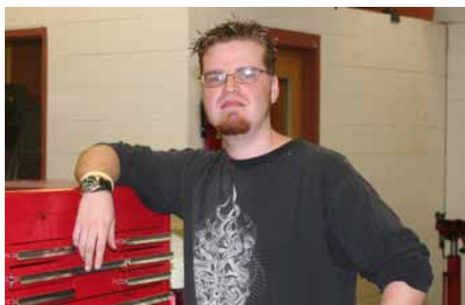
The Mile High United Way SEED program focused on high-school-aged youth transitioning out of the foster care system.

Inclusion in CDAs. As in all optional savings policies, optional enrollment in SEED is challenging. We would think that most families would be very enthusiastic about the financial incentives and savings for their children—and indeed many are—but a larger portion nonetheless sign up very slowly or