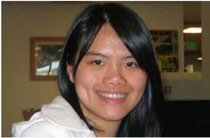
Participants in Juma Ventures' SEED program, like this student, held seasonal jobs and used their earnings as a source of deposits for their SEED accounts.

Perceptions about ability to afford college may also have impacted savings. Research found that SEED families lacked accurate knowledge of the cost of college. At baseline, for example, only 7% of parents at one program could roughly estimate the cost of annual tuition at the local community college (Marks, Rhodes, Townsend, & Olmsted, 2005). In addition, the vast majority of SEED parents overestimated the cost of tuition, usually by a large margin (Beverly, 2006). As a result of these mistaken perceptions of the cost of college, SEED families may have concluded that college was out of reach and, accordingly, saved less than they might have otherwise.