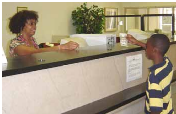
SEED participants made regular trips to the bank or credit union to make deposits in their SEED accounts.

Poverty and household well-being, particularly by race and