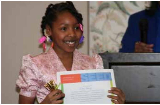
A student shows off a certificate she earned for her participation in the SEED program at Sargent Shriver National Center on Poverty Law.

exclusive policy that leaves low-income Americans behind.