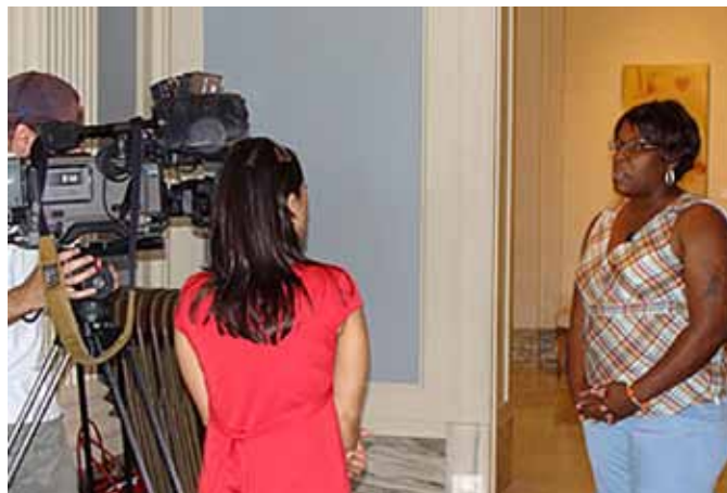
A SEED objective was to communicate CDAs to the media. Here, a participant speaks to reporters about SEED OK.