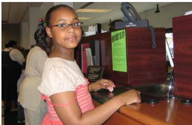
A student from Beyond Housing's SEED program makes a deposit into her SEED account. Students in SEED learned how to fill out deposit slips and read bank statements in financial education classes.

used for approved purposes. They also support accounts with an initial deposit made by the federal government that permits additional contributions and incentives for saving, and is allowed to grow tax-free. Close to seven out of every 10 respondents (69%)—and more than three-quarters of parents (78%)—articulate support for this idea (Peter D. Hart Research, 2007).