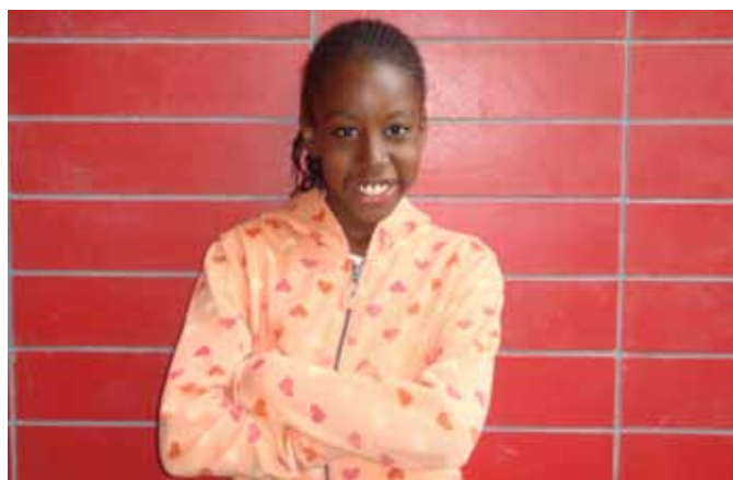
A participant in Harlem Children's Zone's SEED program smiles for the camera. This SEED program, like some others, provided financial education to parents as well as children.

In recent meetings with Obama administration officials to discuss greater inclusion in 529s, there has been considerable interest in not only the financial but also the psychological effects of saving for education. At the end of the day, saving