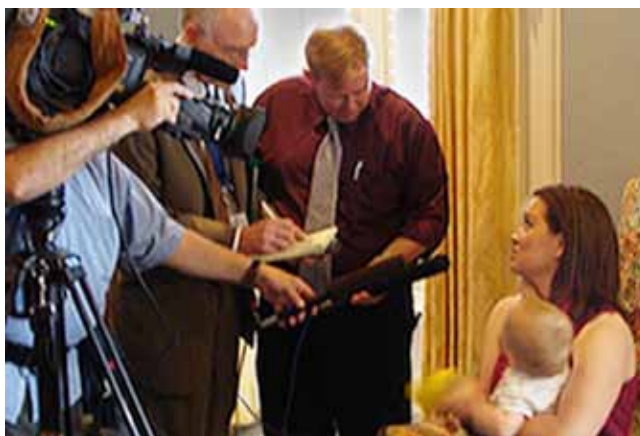
A SEED OK participant speaks to reporters about saving for her child’s college education.

A national system of CDAs is an opportunity to create an automatic investment structure that will mitigate financial service risk, and provide sound choices that can limit investment risk (e.g., the TSP and almost all state 529 plans offer a money market or guaranteed investment option, and we would assume that most financial providers in a market