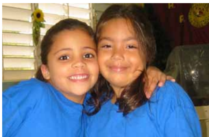
Students at Fundación Chana y Samuel Levis’ SEED program benefitted from a Spanish-language financial education curriculum created by the agency.

Progressive. Progressive means lower-income populations