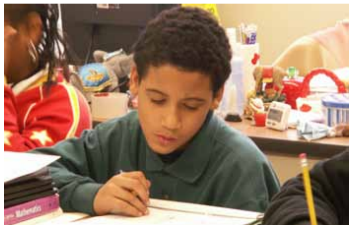
This student, along with others at People for People's SEED program, participated in entrepreneurship training and developed a business selling snacks to raise money for his SEED account.