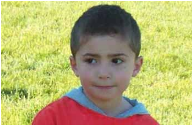
Students at Oakland Livingston Human Service Agency's SEED program were among the youngest participants in the initiative. In the SEED initiative overall, participant age ranged from 4 to 23.