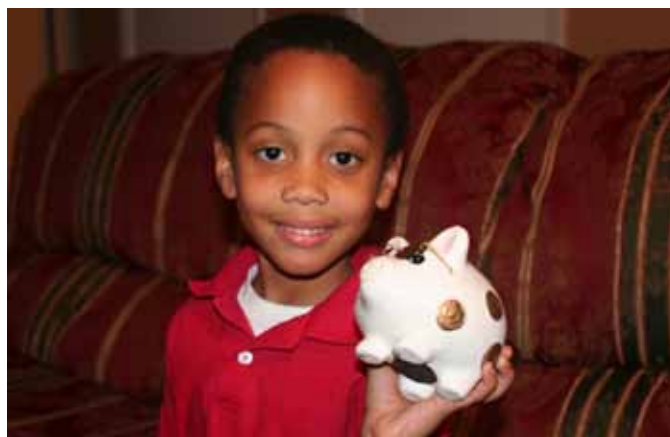
A student from Southern Good Faith Fund's SEED program proudly displays the bank where he keeps his allowance between trips to the credit union.

11. Savings plan structures, such as the federal Thrift Savings Plan or State College Savings (529) Plans, are potential platforms on which to build universal